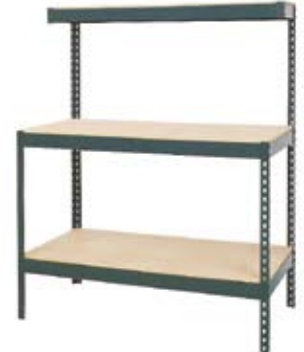
Worksurface plus top and bottom shelf