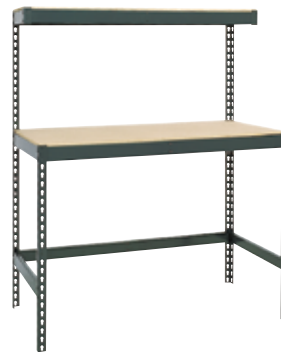
Worksurface plus top shelf